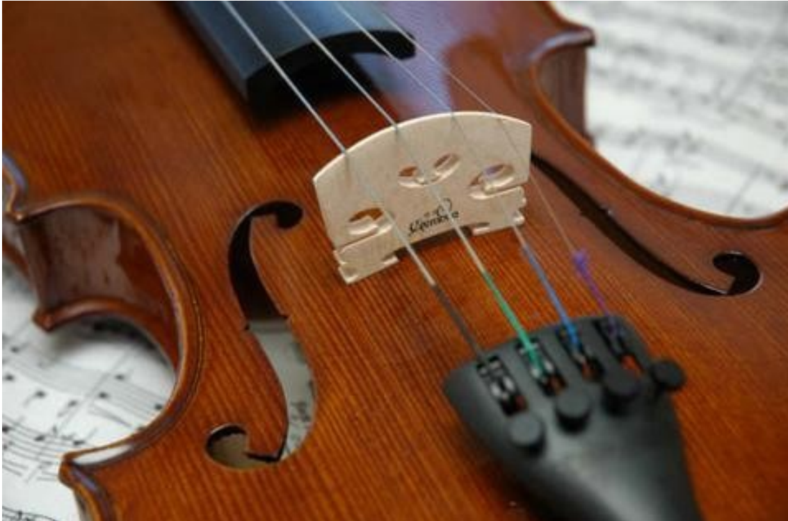
"Belly" side should face toward the scroll.

Violin bridges have a flat side and a rounded ("belly") side. [See closeup photograph, above.] The "belly" side needs to face the scroll. Loosen the strings and set the feet of the bridge between the nicks in the F holes, with, as mentioned, the rounded side of the bridge facing the scroll and fingerboard. Make sure the bridge is straight up and down, at right angles to the top of the instrument, and not tilted in either direction. Please contact customer service if you experience any difficulties. We will be happy to help you.